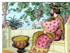
Bible Codes (I'm out! \frac{1}{2} )