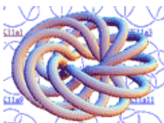
The Knot Atlas