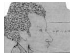
Profile (CV, statements, opinions)