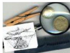
Odds, Ends, Unfinished

<< A >> I don't understand supersymmetry.