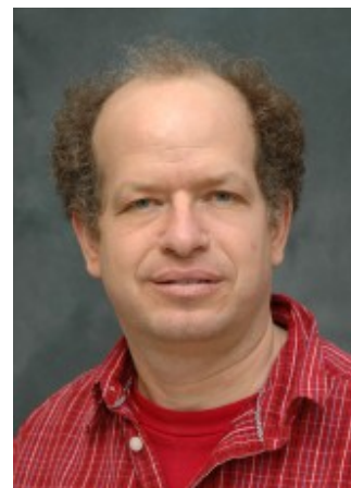
I'm hyper-famous! Click to see how

Slow Mail and Map (@ N43.659513 W79.397751).