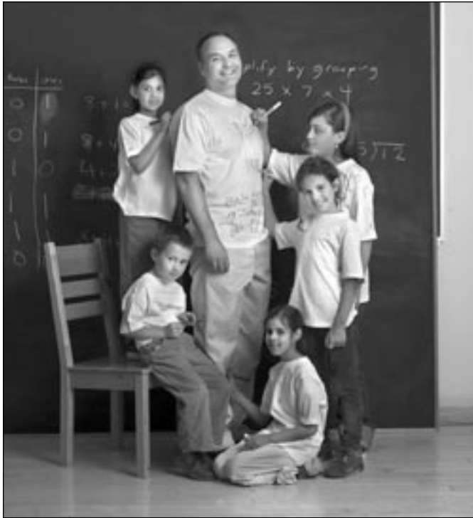
John Mighton and JUMP

A review of JOHN MIGHTON's publication on computing certain polynomials ends with the words, "This interesting idea is well described in this paper." Although there are many well-written mathematical publications, comments on the quality of their presentation are rare. So one suspects something special --- and there is: John Mighton is a celebrated playwright. In 2005 he won the Governor General's Literary Award for his acclaimed drama "Half Life" which also earned him the Eleanor and Lou Siminovitch Prize in Theatre .